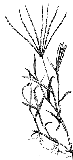
Figure 2. Large crabgrass, Digitaria sanguinalis

In the central and northern parts of the state, crabgrass begins germination around March 1 to 15 when soil tem-