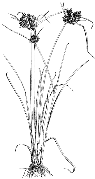
Figure 3. Tall umbrella sedge.

brevifolia ) (Fig. 4), which is also a major problem in turf and ornamental plantings (see UC IPM Pest Notes: Green Kyllinga , Publication 7459). The flower of green kyllinga is visibly different from that of nutsedge, and the plant does not produce tubers.