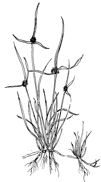
Figure 4. Green kyllinga.

Nutsedges do not grow well in shade. By changing landscape plantings you