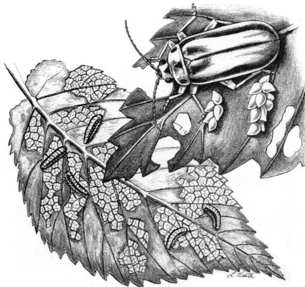
Figure 1. Elm leaf beetle adult and eggs (5×), and third-instar larvae and damage (life size).

Adults commonly overwinter in bark crevices, litter, woodpiles, or in buildings. They fly to foliage in spring and feed and lay yellowish eggs, which become grayish before hatching. After feeding in the canopy for several weeks, mature larvae crawl down the tree trunk, become curled, inactive prepupae, and then develop into yellowish pupae (Fig. 2). After about 10 days, adult beetles emerge from pupae around the tree base and fly to the canopy to feed and (during spring and summer) lay eggs. Elm leaf beetle has at least one generation a year in northern California and two to three generations in central and southern California.